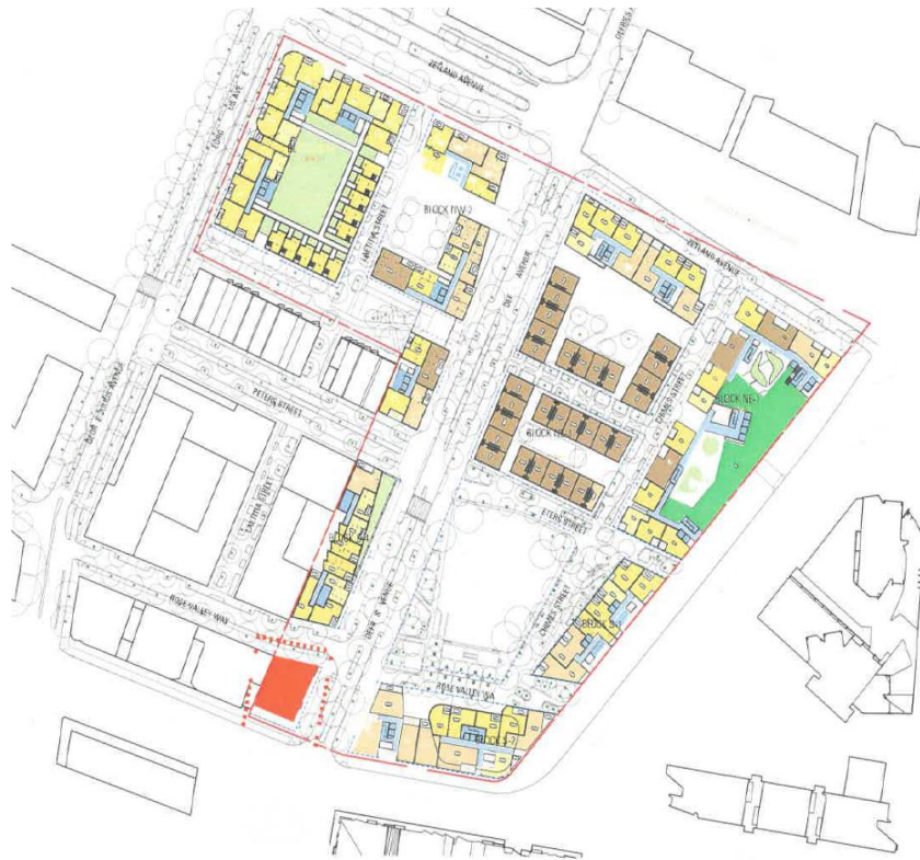
Figure 1: Proposed location of the affordable housing building (shown in red)